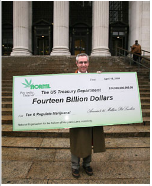
NORML Executive Director Allen St. Pierre presents a mock check to the U.S. Treasury Department in the sum of $14 billion at a press conference on the steps of the General Post Office in New York City.

"We represent the millions of <continued on page 3 >